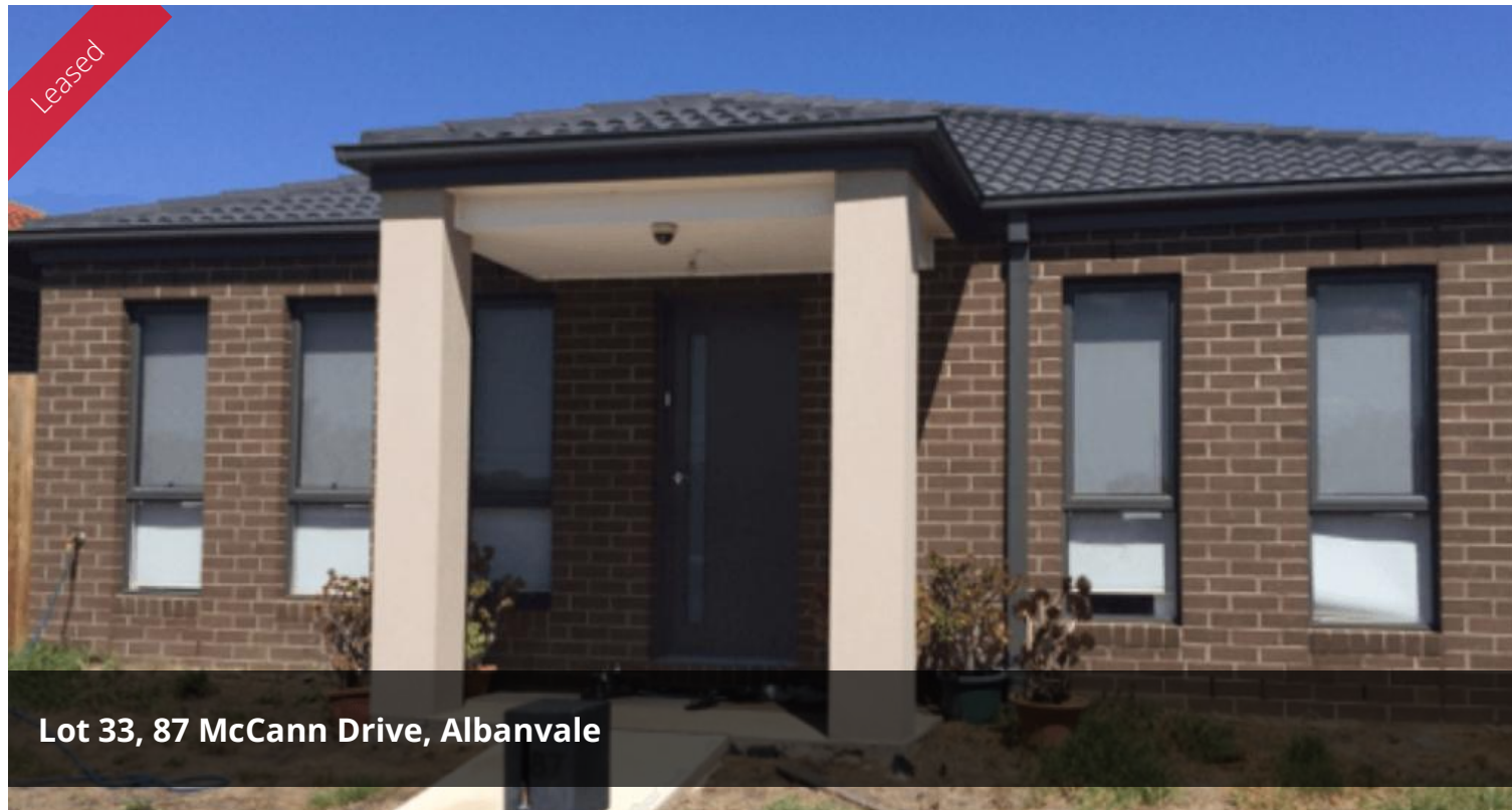
Lot 33, 87 McCann Drive, Albanvale